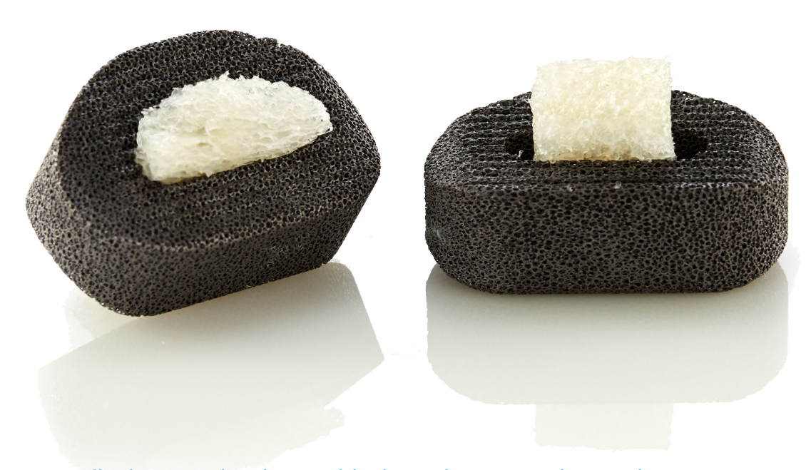
Fully demineralized Puros blocks and strips can be used with Trabecular Metal™ Material (TM-400 Device)

Puros DBM Block and Strip are available in a variety of configurations to minimize the need for shaping during the surgical procedure. They are conveniently provided sterile with up to a five-year shelf life at room temperature.