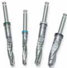
Driva EG Drills