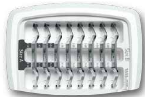
Tube Adapter Module